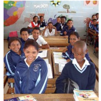
School children at Imperial Primary School in Eastridge, Mitchell's Plain (Cape Town, South Africa). Picture taken by Henry Trotter, 2006. (Image: Wikimedia Commons)

It is also very interesting to note that the latest literature also warns that even adolescents using the Internet for project literature searches, show a certain lack of proficiency in doing so. The latest cognitive developmental literature reports that adolescents and children alike are distracted by pop-up menus, and often ignore the source references, and also tend to believe that what is written on the Internet is always true. This applies to both blogs with a personal and non-scientific content, as well as academic articles. The study's author concludes that adolescents struggle to discriminate fact from opinion, and thus make inaccurate credibility assessments (Eastin, 2008).