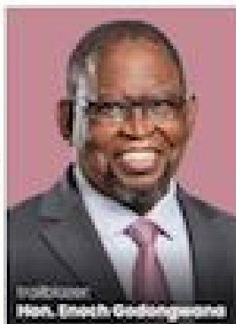
Portfolio: Hon. Enock Godongwana