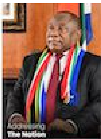
Addressing The Nation