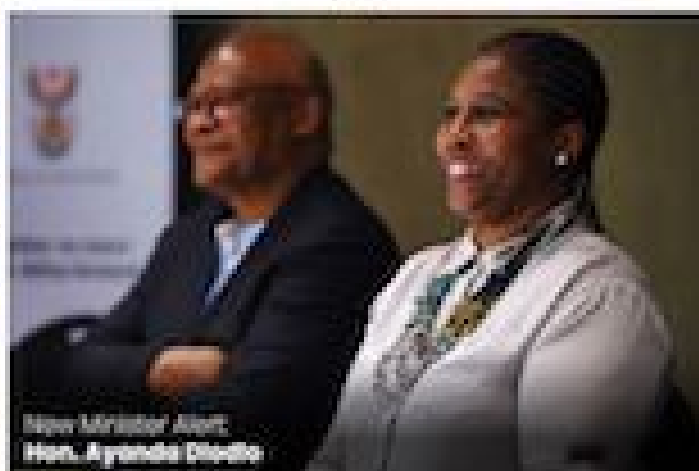
New Minister Alert: Hon. Ayanda Dlodlo