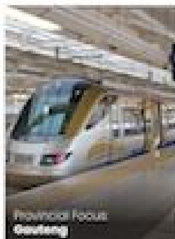
Provincial Focus: Gauteng