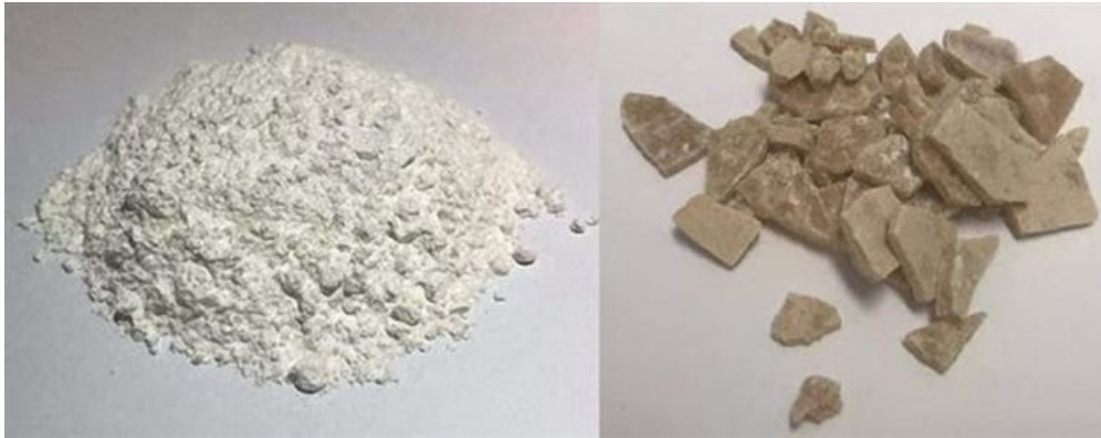
Magnesium oxide (MgO) powder (left) and a solution of magnesium chloride (MgCl 2 ) are mixed to produce magnesium oxychloride cement (MOC).

MOC is produced by mixing two main ingredients, magnesium oxide (MgO) powder and a concentrated solution of magnesium chloride (MgCl 2 ). These are byproducts from magnesium mining.