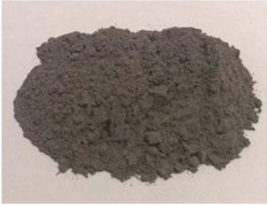
Adding industrial byproducts fly ash (above) and silica fume (below) improves the water resistance of MOC.