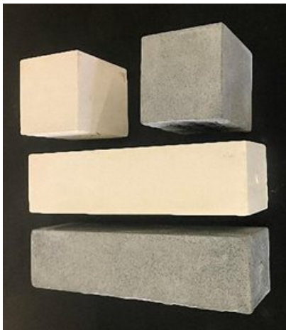
Examples of building products made using MOC.

Although the MOC developed so far had excellent resistance to water at room temperature, it weakened fast when soaked in warm water. The team worked to overcome this by using inorganic and organic chemical additives. Adding phosphoric acid and soluble phosphates greatly improved warm water resistance.