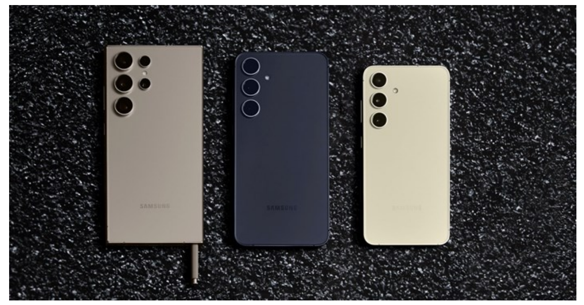
Samsung managed to increase the screen size of the S24 series over its predecessors, but in the same handset size.

Samsung didn't talk about hardware when it <u>launched the Galaxy S24 series</u> at the SAP Center in San Jose on Wednesday. Instead, the former best-selling smartphone vendor – <u>Samsung was dethroned by Apple this week</u> – took its prime-time opportunity to rather showcase AI capabilities that are powered by innovations from technology partners Google, Qualcomm and AMD.