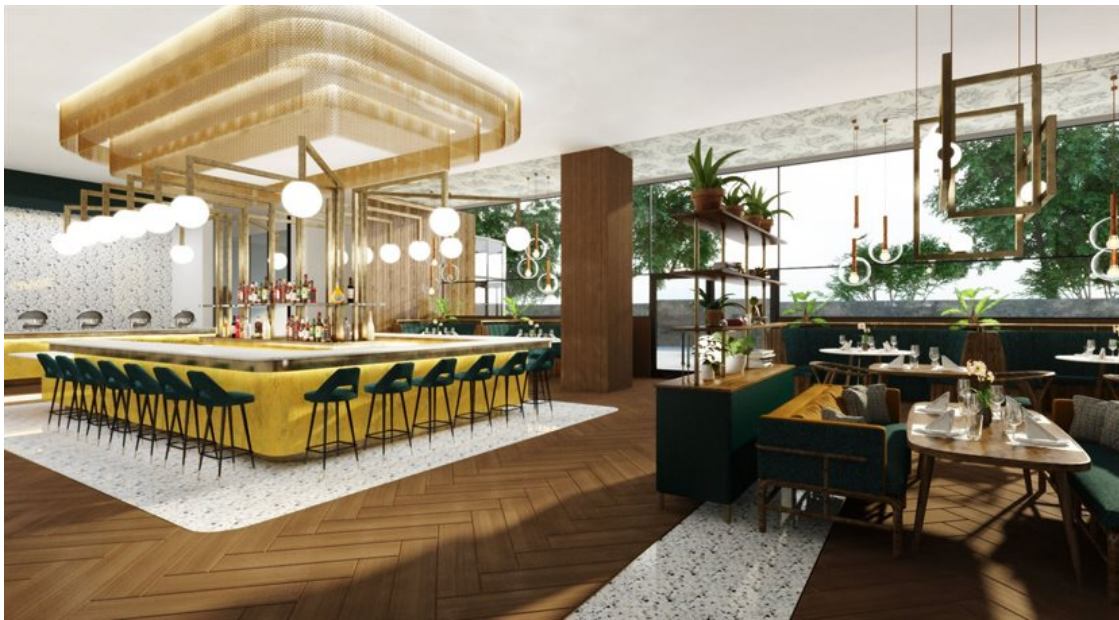
Courtyard Hotel Waterfall City - restaurant

On completion of Courtyard Hotel Waterfall City and City Lodge Hotel Maputo, the group will offer 8070 rooms at 63 hotels in six countries.