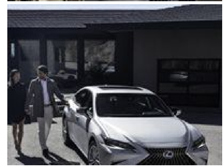
The new ES main features include improved quietness and ride quality and an evolved driving performance as well as further refinements to its high-quality overall comfort.

Its exterior has newly designed headlamps, newly designed wheels and new colours. The interior has a multimedia system that features a touch display with a glass screen for improved visibility and operability.