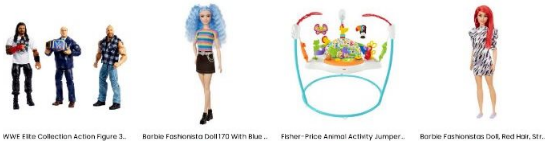
Fraudulent page selling Barbie dolls.

One of the fraudulent pages discovered lures users with special offers on Barbie dolls coinciding with the movie launch.