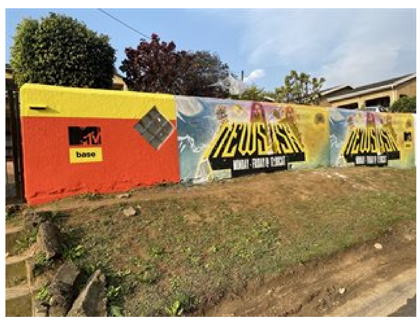
click to enlarge