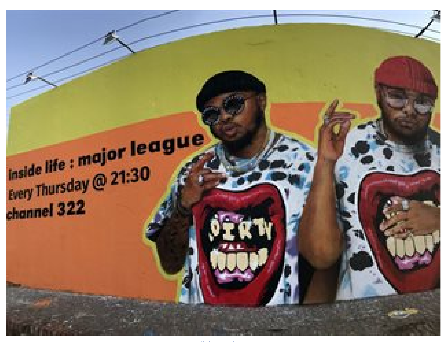
click to enlarge