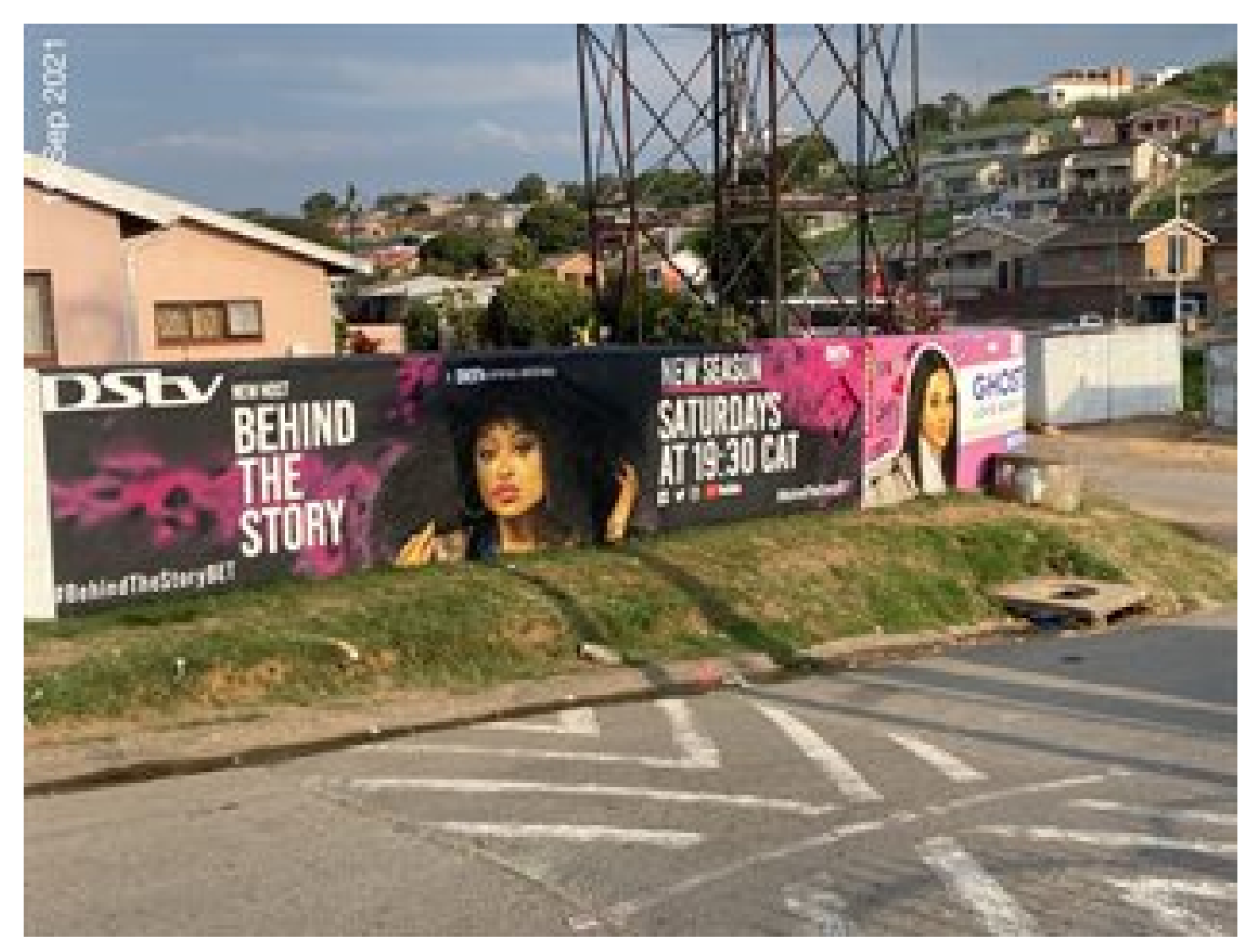
click to enlarge

The townships of South Africa are the biggest consumer database in the country, and there lives the entire spectrum of consumer profiles and levels.