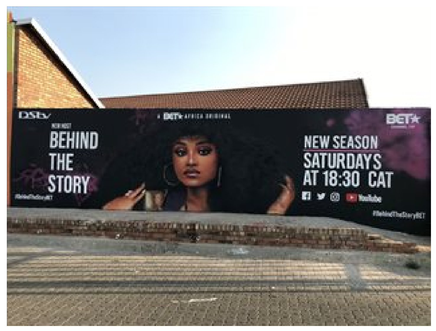
click to enlarge